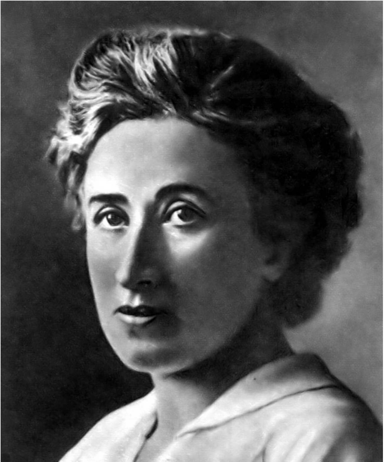
Rosa Luxemburg, 1871-1919

Rosa Luxemburg was tortured and murdered on 15 January 1919